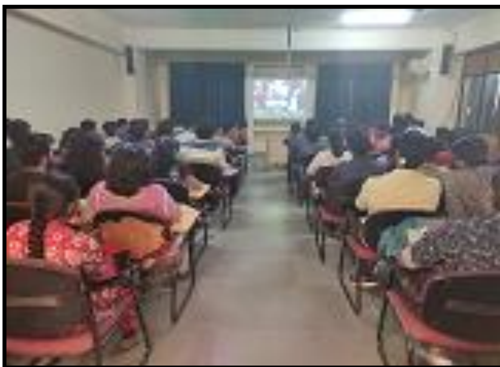
Participants watching Live Telecast from Parliament