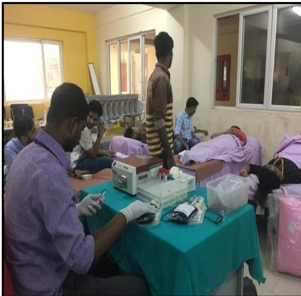
Blood donation by Students

After that, the doctor from Rotary Club delivered the speech extolling those who had donated their blood. Blood donation is a divine act of giving life. NSS motivational act has encouraged many to join hands with us as donors. 100 donors includes students, Teaching & Non-Teaching staff have participated and donated blood in this camp.