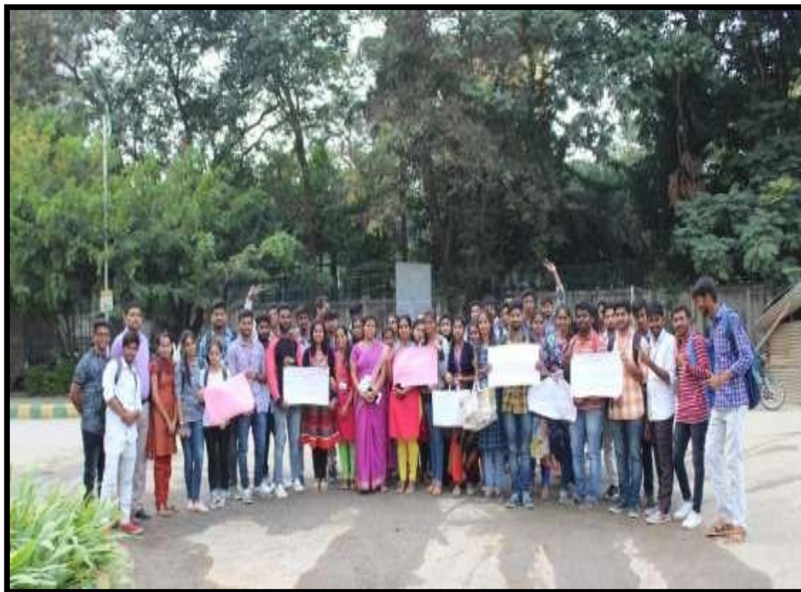
Plastic free awareness rally in the college premises

SwachhtaHi Seva2019 campaign was launched by Prime Minister Narendra Modi on September11,2019.The theme of the campaigns ' plastic waste awareness and management '.Taking Prime Minister Narendra Modi's ambitious Clean India Mission a step forward, TheOxford College of Engineering,Bangalore has conducted Swachhata Hi Seva campaign in the campus for awareness creation on single use plastic.