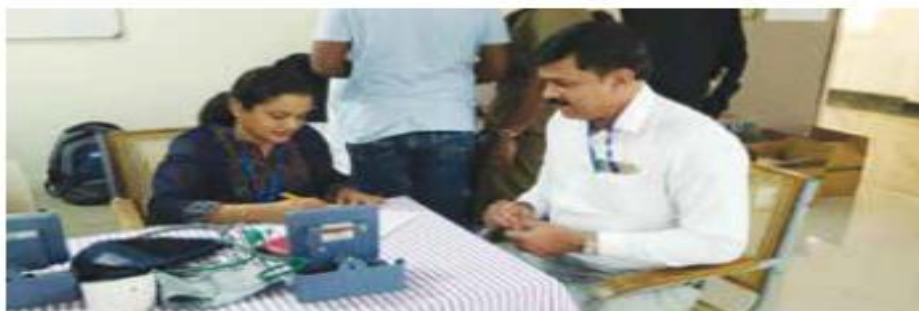
Principal @ blood donation camp-2k18