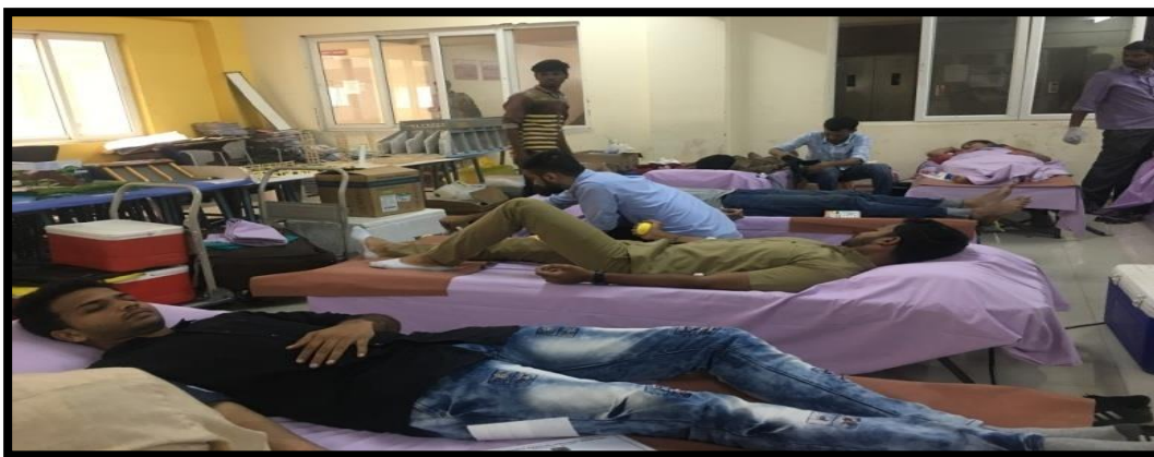
Participants during Blood Donation

In the college premises the arrangements were made for the donors like registration counter, beds, sanitations, counseling and medical check-up of potential donors. A team of doctors and nurses had reached in time. The donors were provided with glucose water and food including biscuits, a banana and a juice. It was great to see more people than pre-registration numbers turning up in the venue.