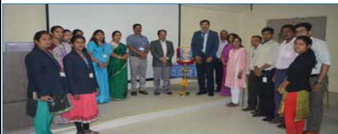
126th Dr B.R. Ambedkar Jayanthi