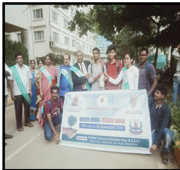
The Picture of the plantation drive program by MHRD