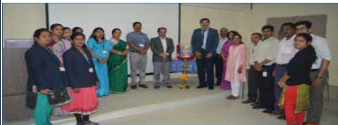
126th Dr B.R. Ambedkar Jayanthi