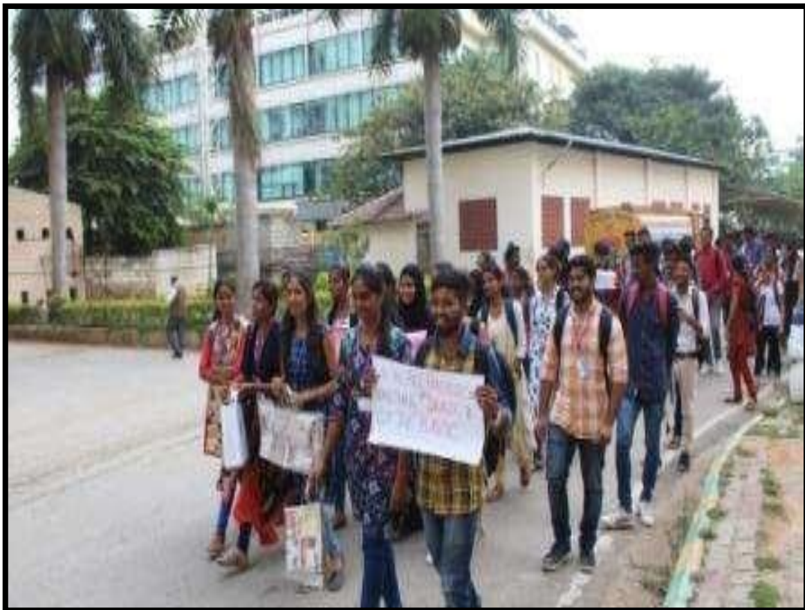
Plastic free awareness rally in Garebhavipalya Road

In the first phase on October 1 st , 2019, of the three-phased massive Swachhata Hi Seva campaign, The Oxford College of Engineering has created the awareness to stop the single-use plastic.