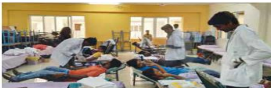
Students voluntary blood donation-2k18