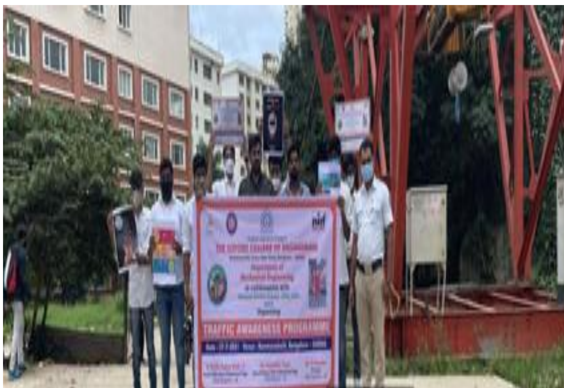
Group Photo After the Program